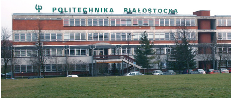
To the left, a picture of our new Member University: Białystok University of Technology, in Białystok, Poland.