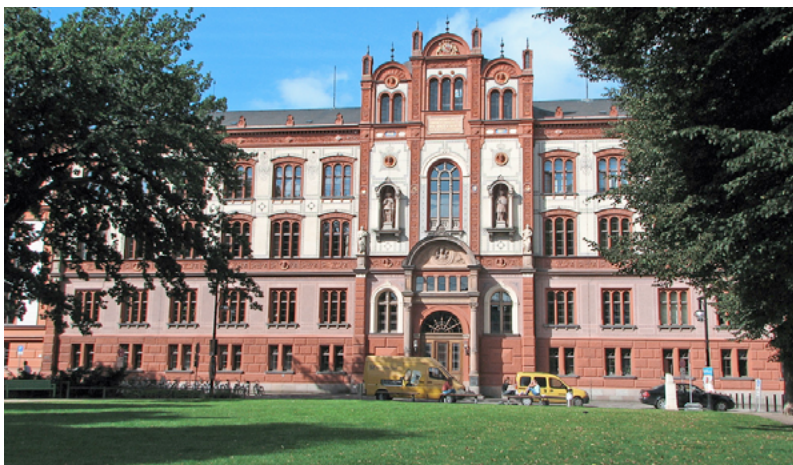
To the left, a picture of our new Member University: University of Rostock, in Rostock, Germany.